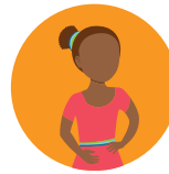
Custody Guardian ad Litem