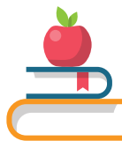
Teachers and Social Workers